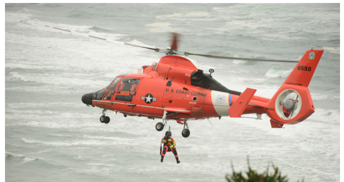
Coast Guard Air Station Humboldt Bay

generation system will energize the microgrid, enabling extended operation on 100% renewable energy. The IOU will own, operate, and maintain the microgrid circuit, including protection and control devices, as well as control the microgrid during islanded operation.