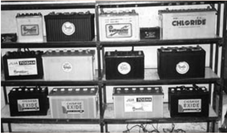
Different types of batteries, including: automotive battery, solar battery, true deep cycle battery and a seal battery