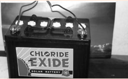
A solar battery with a proper wire connection for a battery terminal

will not last nearly as long as it should! It is very important to explain this to your customers so that they can conserve energy or take the battery for a charge as soon as they think it may be getting low. Of course, this can be difficult because without a volt meter or some other way of knowing the charge of the battery it can be hard for users to know when the battery is getting low.