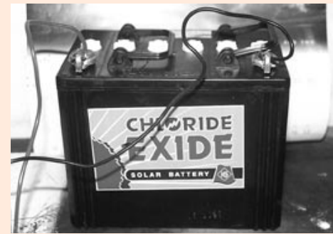
Wrapping of wire around the terminal, and not connected properly is a poor connection

4) Finally, round up to the next nearest battery size that is available in the shops. In our case this is a 50 amp-hour solar type battery.